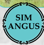
PCR Future Force E739