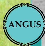
PCR Impressions Lady Z296