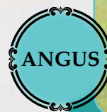
PCR Program Mother Y155