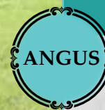
PCR 2U66 Etta A328