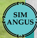
PCR P429 Impression Z228