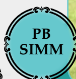
PCR W923 Sure Bet Y123