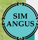
PCR A328 Wolf Pack E789